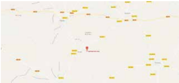
Puig de Randa, S/N, 07629 Randa, Illes Balears

It dates back to 1266. Mallorca's sacred mountain. The place where Ramon Llull reportedly achieved enlightenment. A viewpoint from which you can contemplate the entire island of Mallorca. Restaurant/ Cafeteria and hostel.