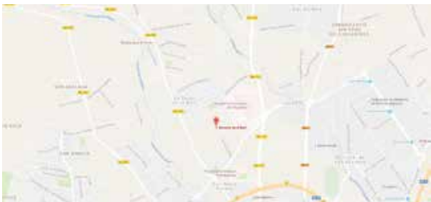
Camí Real · 07010 · Palma

Since the 13th century, this monastery has been linked to the Kings of Mallorca, the great Ramon Llull, the Cistercian Order and Bernat de Claravall. A vibrant pilgrimage site. A wonderful cloister. A unique library.