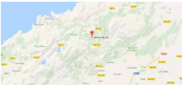
Plaça dels Peregrins, 1 07315 · Escorca · Mallorca

The Sanctuary of Lluc is the religious hub of Mallorca. Its choir school is one of the oldest in the entire world. A place where architect Antoni Gaudí left his mark. With a wide array of cultural and nature-oriented activities on offer.