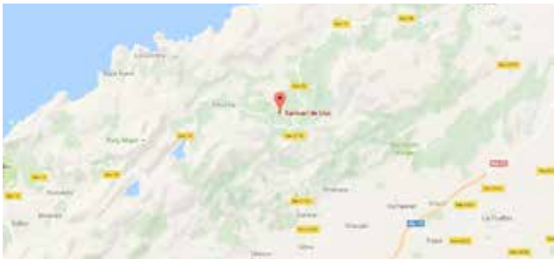
Plaça dels Peregrins, 1 07315 · Escorca · Mallorca

ROOMS The guest accommodation consists of 81 rooms and 39 apartments with kitchen, all of which have private bathroom, central heating and TV. The individually decorated rooms are bright and spacious. Whichever you choose you are sure to have an unforgettable experience, imbued with the peace and tranquillity of which we are so proud.