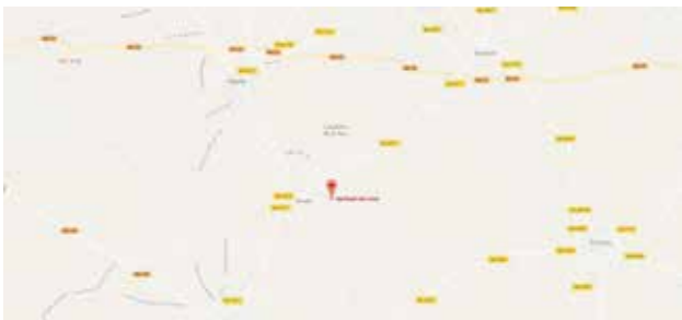
Puig de Randa, S/N, 07629 Randa, Illes Balears

ROOMS There are 33 rooms: 23 doubles 6 Superiors 4 Junior Suites