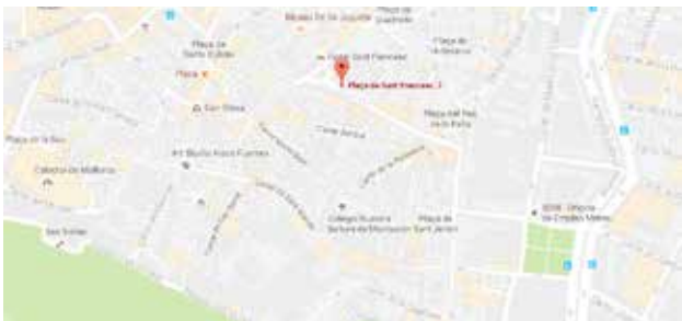
Plaça de Sant Francesc, 7, 07001 Palma, Illes Balears

An historic ensemble dating back to 1281. The most extraordinary cloister in Palma. A unique basilica where the remains of the most international Mallorca figure rest: Ramon Llull.