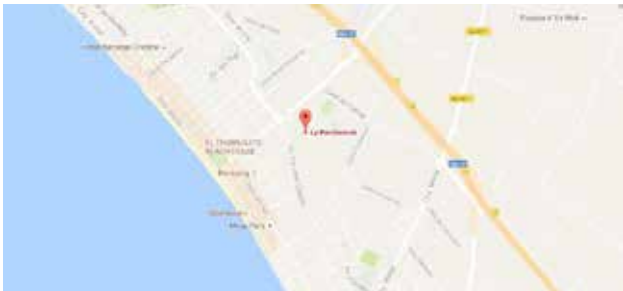
La Porciuncula, Avinguda Fra Joan Llabrés · Palma

LA PORCIÚNCULA An historic ensemble dating back to 1281. The most extraordinary cloister in Palma. A unique basilica where the remains of the most international Mallorca figure rest: Ramon Llull.